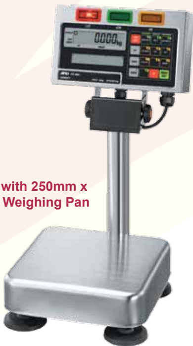
FS-6Ki with 250mm x 250mm Weighing Pan