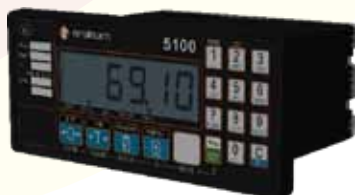
TYPICAL DIGITAL WEIGHT INDICATOR (FOR AUTOMATION AND BATCHING)