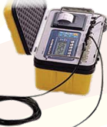
RW-2601P Processing Unit