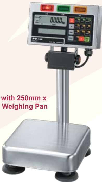
FS-6Ki with 250mm x 250mm Weighing Pan