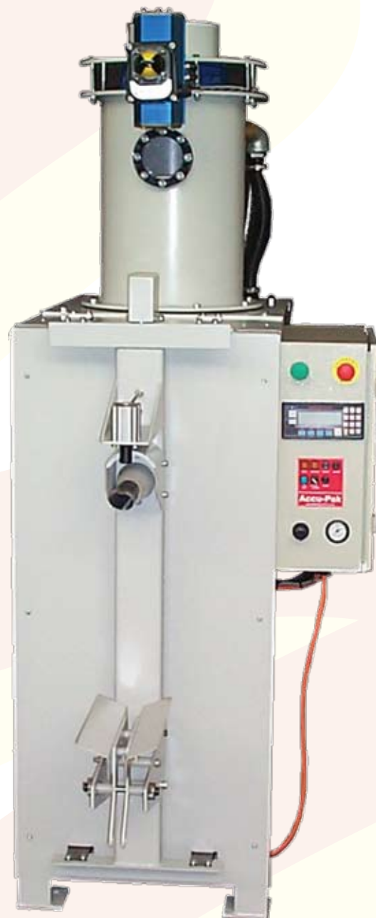
VA2550 VALVE BAG FILLER