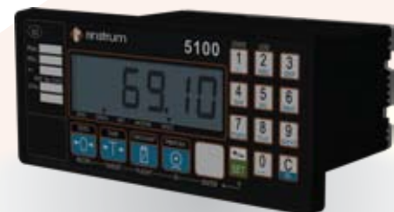
RINSTRUM 5100 DIGITAL BATCHING INDICATOR