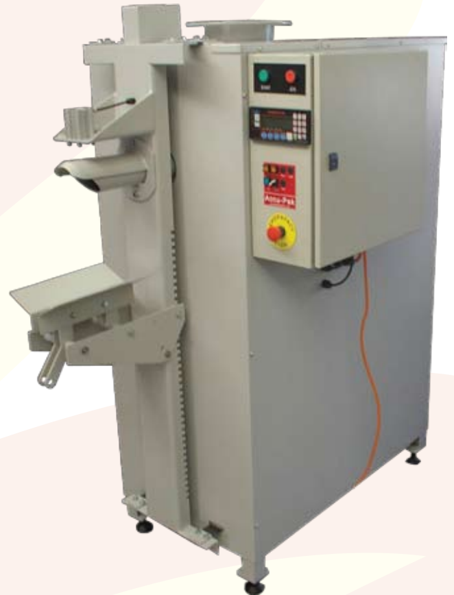
VA25 AUGER FILLER