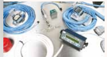
Tractor & Trailer Kit