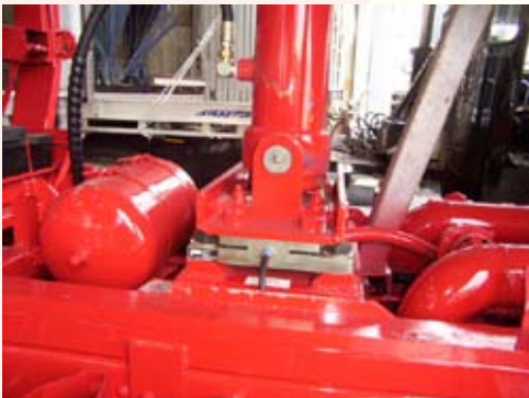
RAM LOADCELL INSTALLATION

Analogue and digital CANbus combine for complete compatibility between old and new systems enabling easy-to-read on-screen error messages should a problem occur.