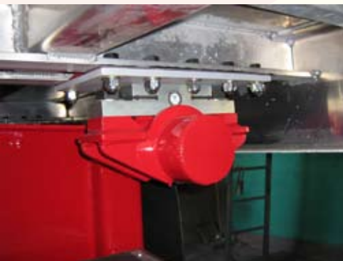
HINGE PIN LOADCELL INSTALLATION