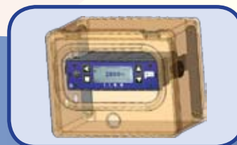
Trailer Chassis Mount