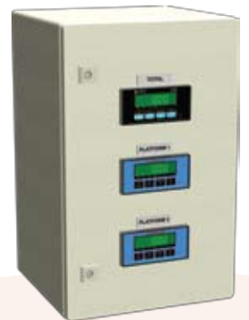
SAMPLE DISPLAY ENCLOSURE

AVAILABLE AS TRADE APPROVED OR NON-TRADE