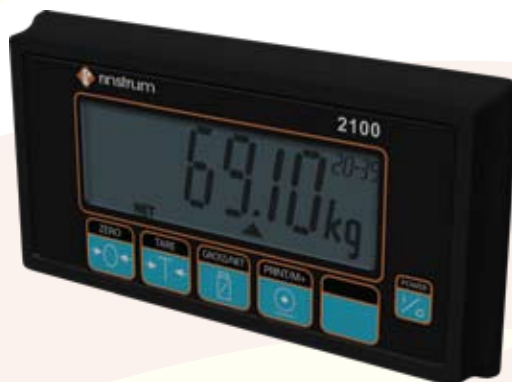
RINSTRUM 2100EX INTRINSICALLY-SAFE OFF-THE-SHELF DIGITAL INDICATOR

The Digital Indicator may be an off-the-shelf intrinsically-safe indicator, or an existing digital indicator modified to be explosion-proof.