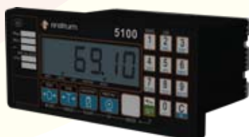
TYPICAL DIGITAL WEIGHT INDICATOR FRONT PANEL DISPLAY